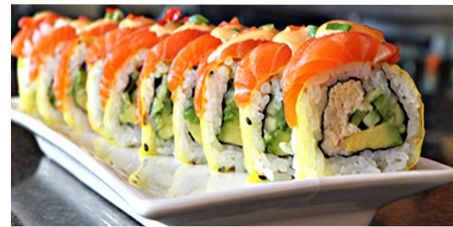
Orange Salmon Roll