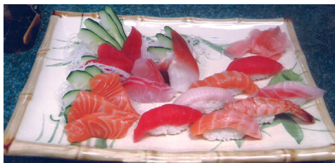
Sushi / Sashimi Combo